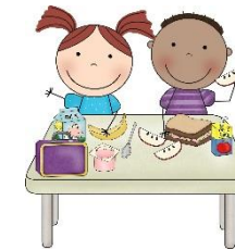
Eat lunch with a friend Pass