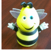
Honey Bee Finger Puppet