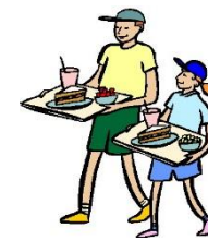
Invite special guest for lunch Pass