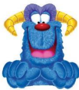
Furry Friend Pass