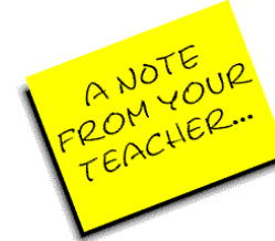
Note home and Share about a day Pass