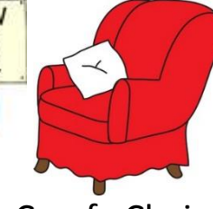
Comfy Chair for a Day Pass