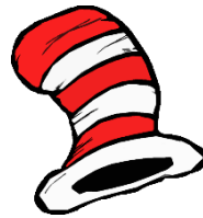
Hat Day Pass