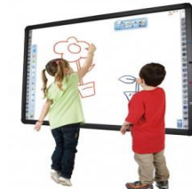
10 minute SmartBoard Pass