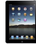
10 minute Ipad Pass