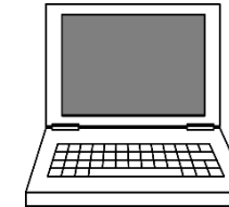
10 minute Computer Pass