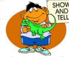
Show and Tell Pass