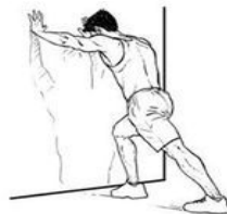
Calves - 2