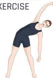
ARM, LEG AND TORSO STRETCH