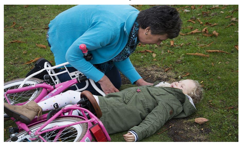
Practice #3: How did you do?