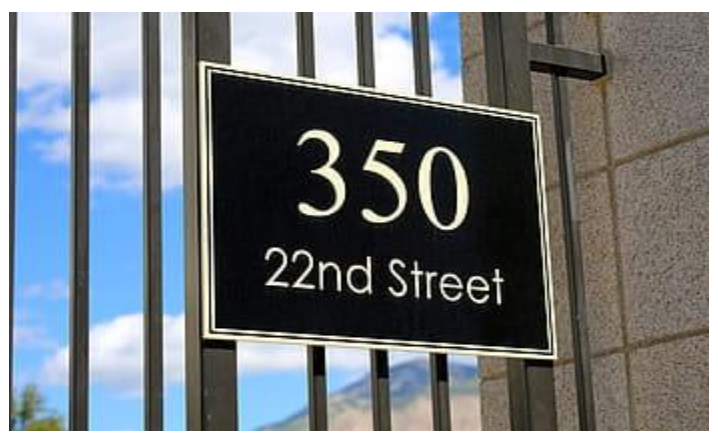
Practice #1 How did you do?