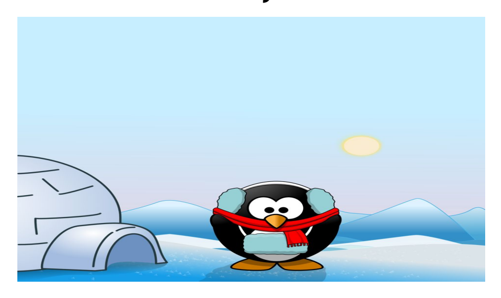
Practice #1 How did you do?