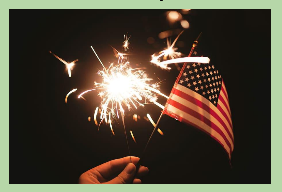
Practice #3: How did you do?

We celebrate our freedom on the 4th of July.