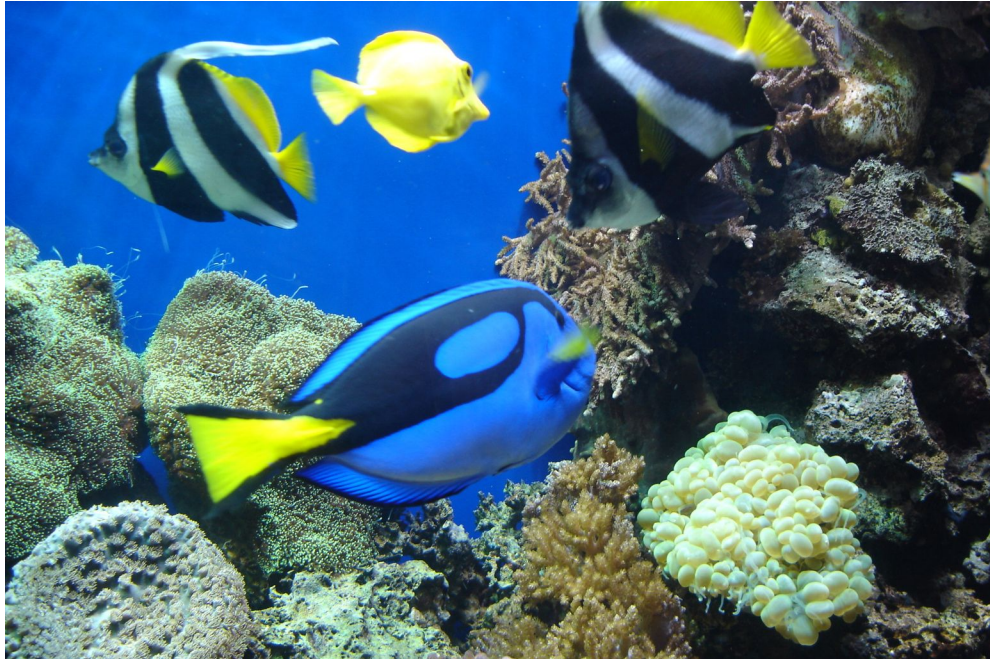
Oaks, Linda. bluetang.jpg . 2008. Pics4Learning. 30 Apr 2020